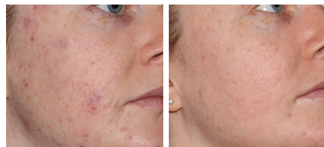
8 weeks post 5 treatments