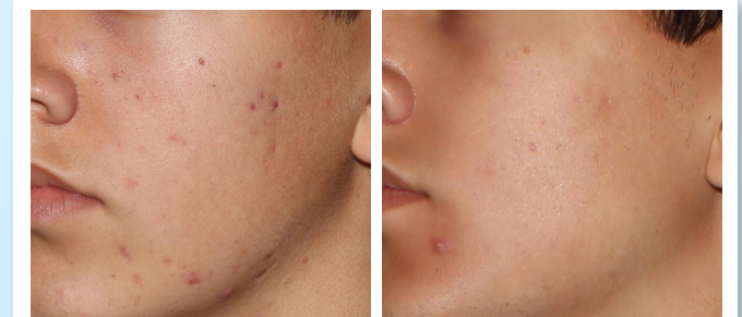
3.5 months post 9 treatments