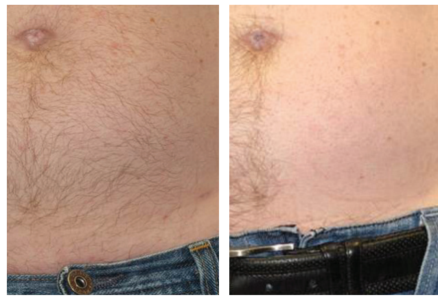
2 months post 3 treatments