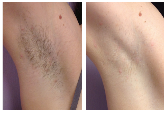
4 months post 3 treatments