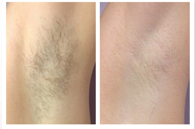
4 months post 3 treatments