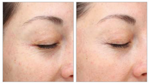
1 month post 1 treatment