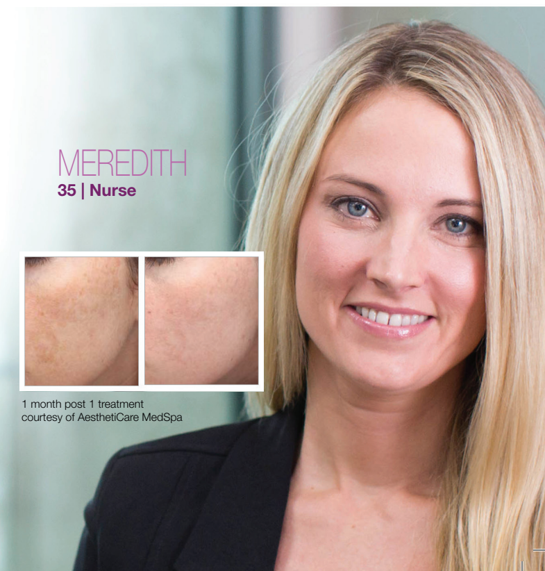
1 month post 1 treatment

Your Halo results can last for years to come, as long as you continue to keep your new healthy skin protected at all times using UV sunscreen.